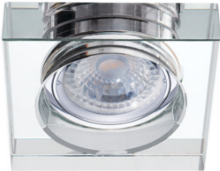
MORTA B CT-DSL50-B